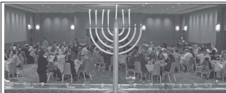
WRJ-Sisterhood & MRJ-Brotherhood hosted the Annual Chanukah Dinner on Shabbat for the 6th night of Chanukah December 2008